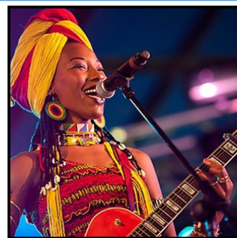
Performance at Norton Center of the Arts—Centre College

On December 4, 1787, the Virginia Legislature established Danville as a town in Virginia. Danville became a part of the Commonwealth of Kentucky when Kentucky became a state in 1792.