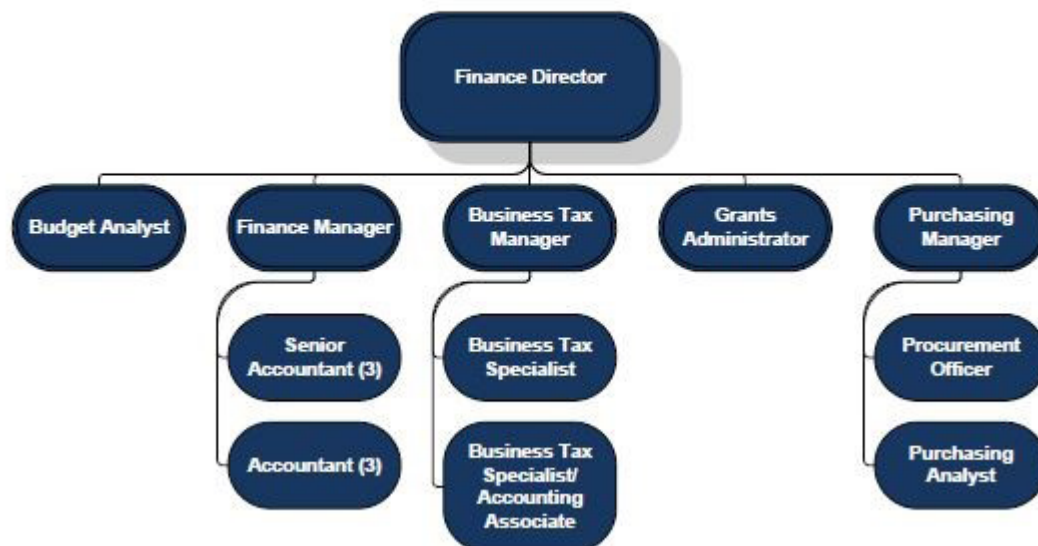
Finance Department Organization Chart