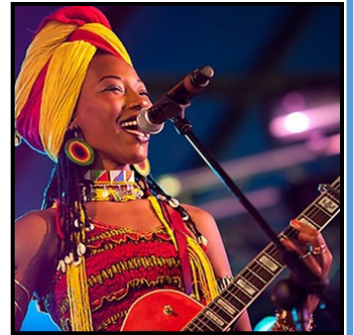
Performance at Norton Center of the Arts—Centre College

On December 4, 1787, the Virginia Legislature established Danville as a town in Virginia. Danville became a part of the Commonwealth of Kentucky when Kentucky became a state in 1792.